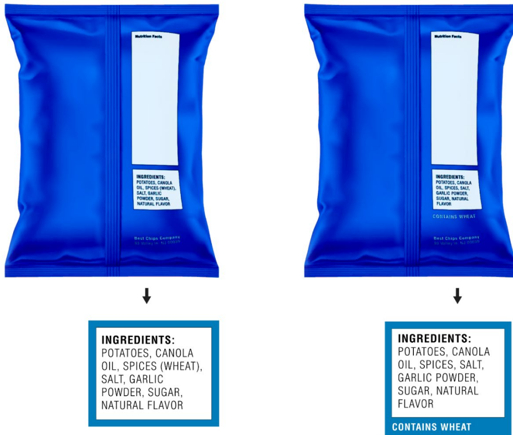
Figure 2. Example of snack bags declaring the major food allergen “wheat” in the ingredient list or in the “Contains” statement. In this situation, wheat flour is used as an anticaking agent in the “spices” ingredient, and it is an incidental additive in the finished chips products. In the image to the left, wheat is declared in the ingredients. In the image to the right, because wheat is not declared in the ingredient list, it must be declared in a “Contains” statement (section 403(w)(4) of the FD&C Act).