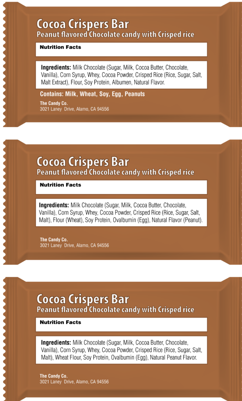
Figure 4. Examples of three ways that allergens can be declared. In the first example, milk and soy are declared in the “Contains” statement. In the second example, milk and soy are declared as part of the common or usual name of the ingredients, but wheat, egg, and peanut are not, so

present in the food are to be declared in the “Contains” statement, even if they are declared in the ingredient list (section 403(w)(1) of the FD&C Act). See Figure 4 below.