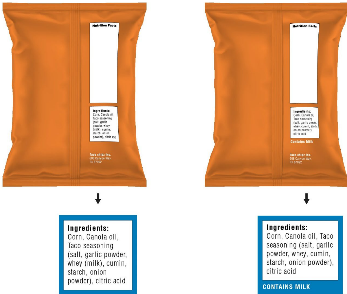
Figure 3. Example of snack bags declaring the major food allergen “milk” in the ingredient list or in the “Contains” statement. In the image to the left, “milk” is declared in parentheses after “whey” in the ingredient list. In the image to the right, “milk” is declared in a “Contains” statement.