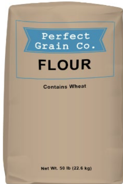
Figure 2. Example of a single-ingredient food intended for further manufacturing where the “Contains” statement is on the front of the food package.

Yes. Single-ingredient foods must comply with the food allergen labeling requirements in section 403(w)(1) of the FD&C Act. A single-ingredient food that is, or contains, protein derived from milk, egg, fish, Crustacean shellfish, tree nuts, wheat, peanuts, sesame, or soybeans may identify the food source from which the major food allergen is derived in the statement of identity (or name of food), e.g., “All-purpose wheat flour,” or use the “Contains” statement format. Because a single-ingredient food does not require an ingredient list, FDA recommends that if a “Contains” statement format is used for a retail package, the statement be placed immediately above the manufacturer, packer, or distributor statement. For single-ingredient foods intended for further manufacturing where the “Contains” statement format is used, we recommend that the “Contains” statement be placed on the front of the package of the food near the statement of identity. See Figure 5.