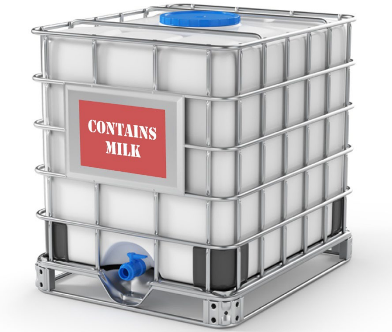
Figure 1. Example of a reusable container of milk that declares the name of the food source from which the major food allergen is derived in a “Contains” statement. The ingredient in this figure is either being shipped between two firms that are under the same ownership (21 CFR 101.100(d)(1)) or between two firms that have a written agreement (21 CFR 101.100(d)(2)), so is exempt from most other mandatory labeling.